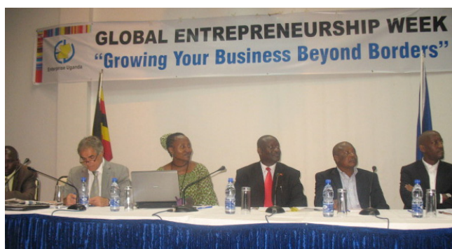
2011 Global Entrepreneurship Week in Uganda