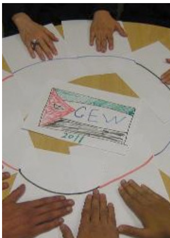
Celebrating Global Entrepreneurship Week at BDC Jordan