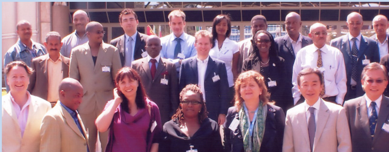
Participants in the UNECA-UNCTAD regional workshop on SME networks in Africa

A task force composed of representatives of UNCTAD, the Economic Commission for Africa and selected countries was established to ensure follow-up and joint initiatives for selected pilot programmes in Africa.